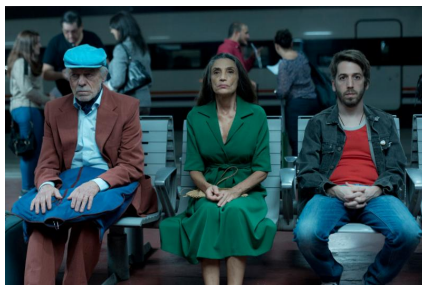
click on picture to see trailer for The Last Suit.

THE LAST SUIT - Trailer with English subtitles from Latido Films on Vimeo . " track="on" >